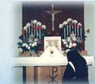
Our Chapel in Fort Worth on Sunset Terrace