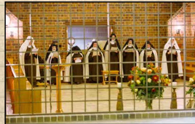
Remember ~ Day and Night on Carmel's Height, Someone Prays for You!

"The mercies of the Lord I will sing for ever."