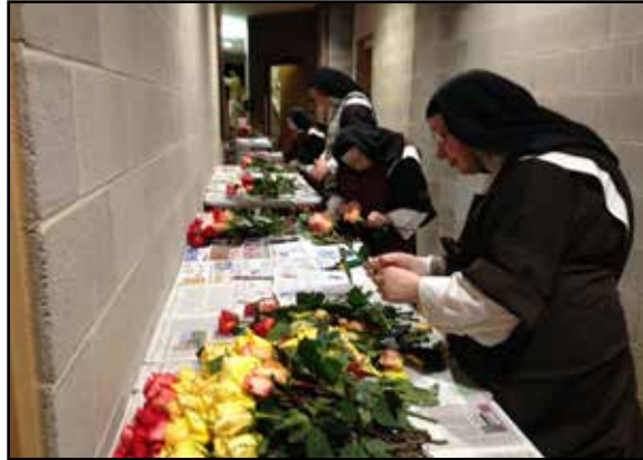
The Sisters preparing the roses for the Feast of St. Therese

The Profession takes place within the Mass as a sign of the public witness that Religious give in the name of the Church to her life and holiness. When the Nun makes her Solemn Profession she promises Poverty, Chastity and Obedience to God "until death" as a total consecration of her whole being in an act of adoration and of giving herself for the salvation of souls and the good of the Church.