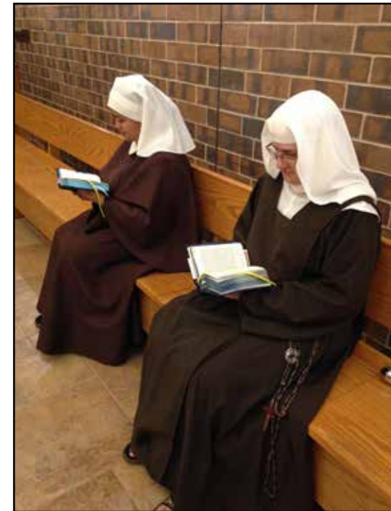
Our Novices praying the Divine Office in Choir